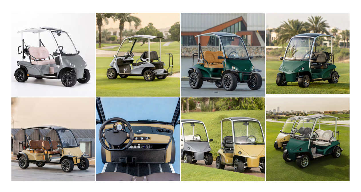
Learn more about the Desert Collection at garia.com